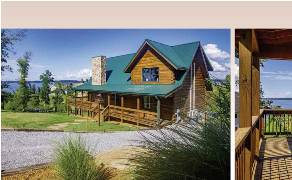
ABOVE The Lewis home is constructed of kiln-dried Timberhaven D-shaped 8-by-12-inch white pine logs with dovetail corners. The Timberhaven R-38 roof system complements Andersen windows and Thermo-Tru doors, standard in the Timberhaven package.