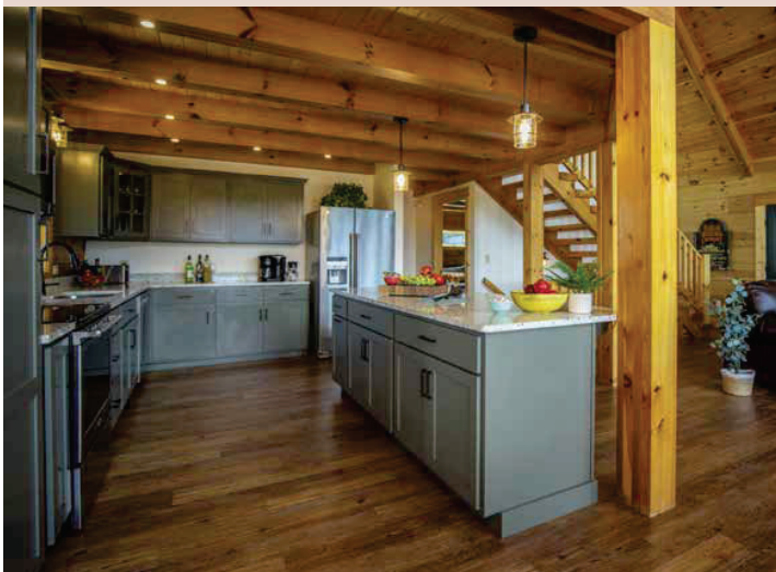
ABOVE Open to the great room and surrounding spaces, the efficient kitchen includes a breakfast bar and ample cabinetry in a rich sage green, with Maytag appliances and granite countertops punctuating the simple space.

room honors Tim's 20 years as a U.S. Navy pilot, complete with photos and memorabilia.