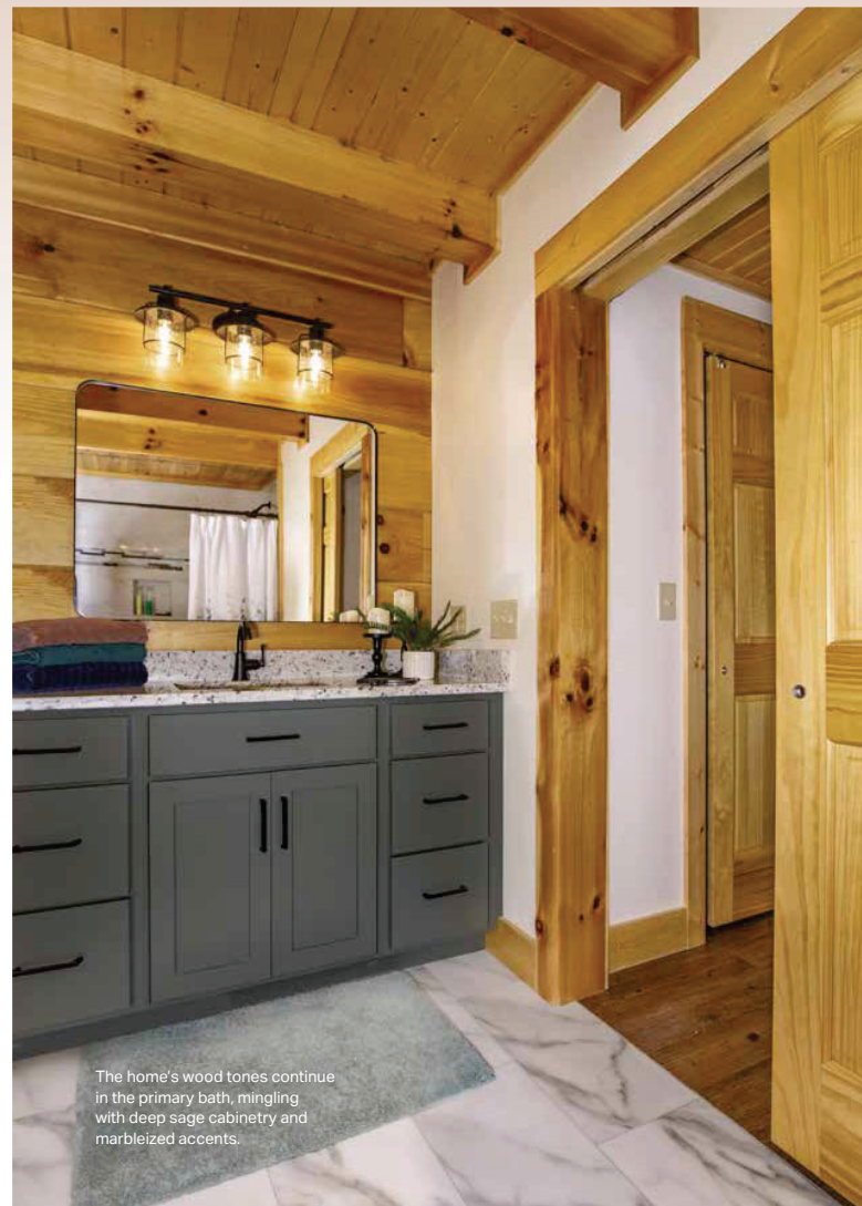
The home’s wood tones continue in the primary bath, mingling with deep sage cabinetry and marbleized accents.

“From the deck overlooking the lake, we often reflect on what we lost—and what we found,” Tim offers. “We lost a house,” Jane observes, “but we never lost our home. That was always in our hearts.”