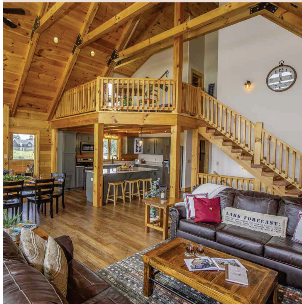
BELOW Pine beams are on full display in the almost cathedral-like great room, illuminated by the abundant natural light and inconspicuous fixtures.