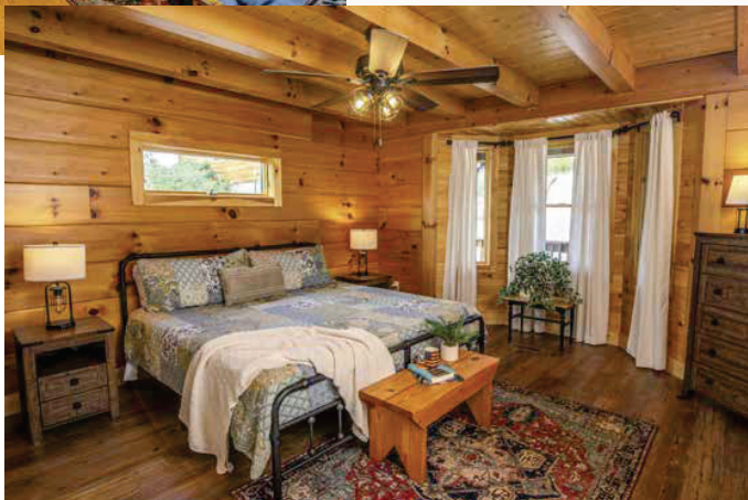
RIGHT The primary bedroom, conveniently located on the main floor, is elegant in its simplicity. Richly hued luxury vinyl tile flooring mimics the look of hardwood with practicality and affordability in mind.

Now, the couple is happily retired and divide their time between California and Kentucky, six months in either locale. After experiencing such loss, the Lewises affirm that the “soul of the cabin lies in what was salvaged.” Two irreplaceable treasures were rescued from the debris, a table Tim had built from his grandfather’s barnwood and the dining room table handcrafted by Jane’s