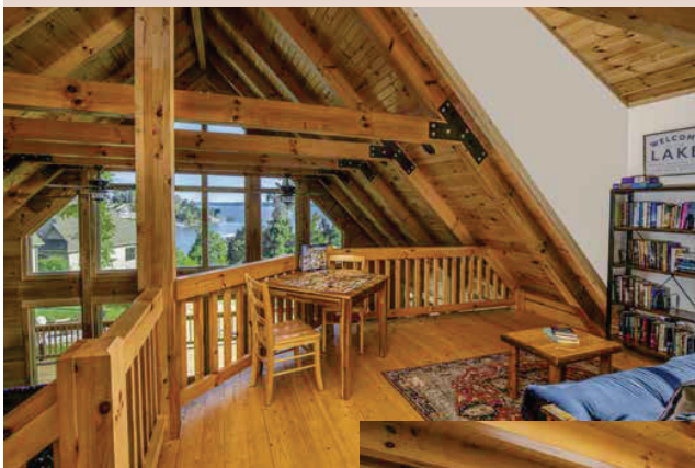
LEFT The cozy loft, with a reading nook and game table for puzzles or checkers, connects two bedrooms and a full bathroom upstairs. It's also the ideal lookout to the waterfront.