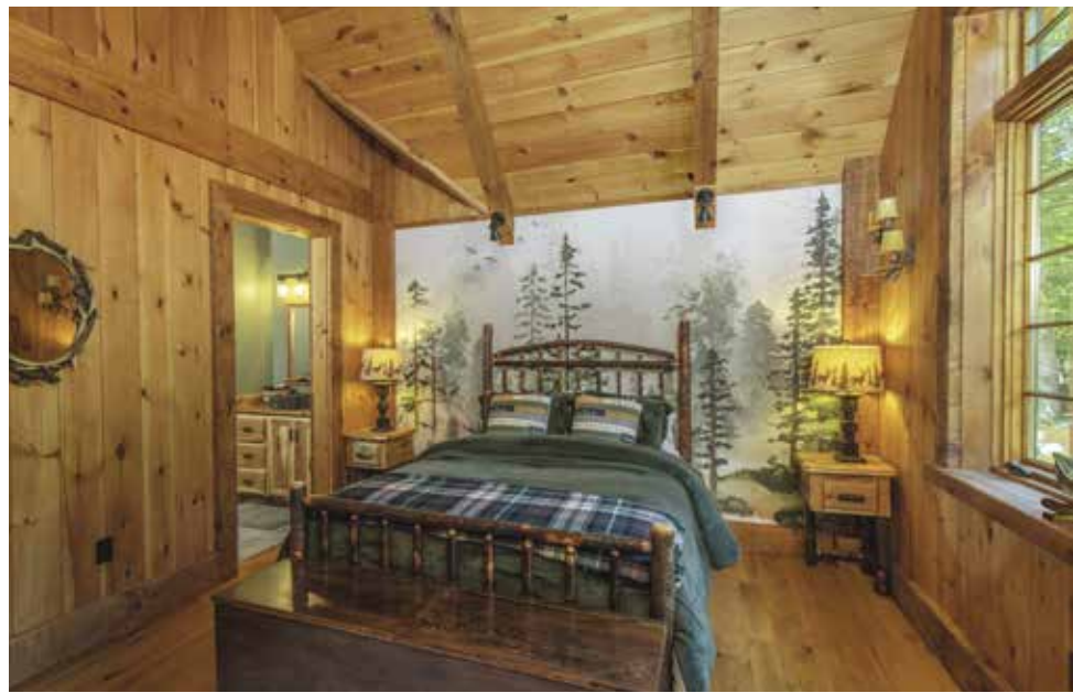
TOP The statement-making soaking tub mirrors the granite-alcove treatment of the adjoining primary bedroom. BOTTOM, LEFT TO RIGHT Even the small half-bath is given the royal treatment. A stone vessel sink is mounted on an open live-edge slab, while the plumbing is cleverly disguised beneath. Inspired by the home's wooded setting, a forest-themed mural that Christine found on Etsy serves as a serene backdrop in the guest bedroom she calls "the white-tail room."

ABOVE Themed like a medieval castle, the primary suite features a granite accent wall with narrow, period-appropriate windows. "If you look closely, you can see the sparkles in the stone," says Tom. To accommodate the weight of the rock, a support wall had to be added in the basement. "Some areas of the stone are 4 inches thick," he continues. "It was amazing watching them chip away at the rock to get the stones to fit just right."