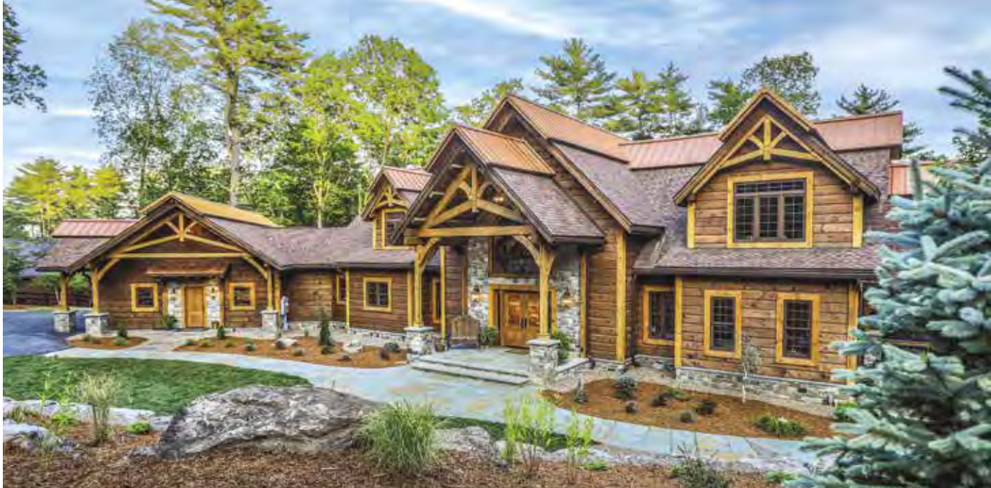
ABOVE The footprint of this super-sized house is sprawling by design. Christine and Tom wanted all the necessary spaces on one level for future accessibility, but the layout also affords expansive views of the lake that lies just outside their back door.