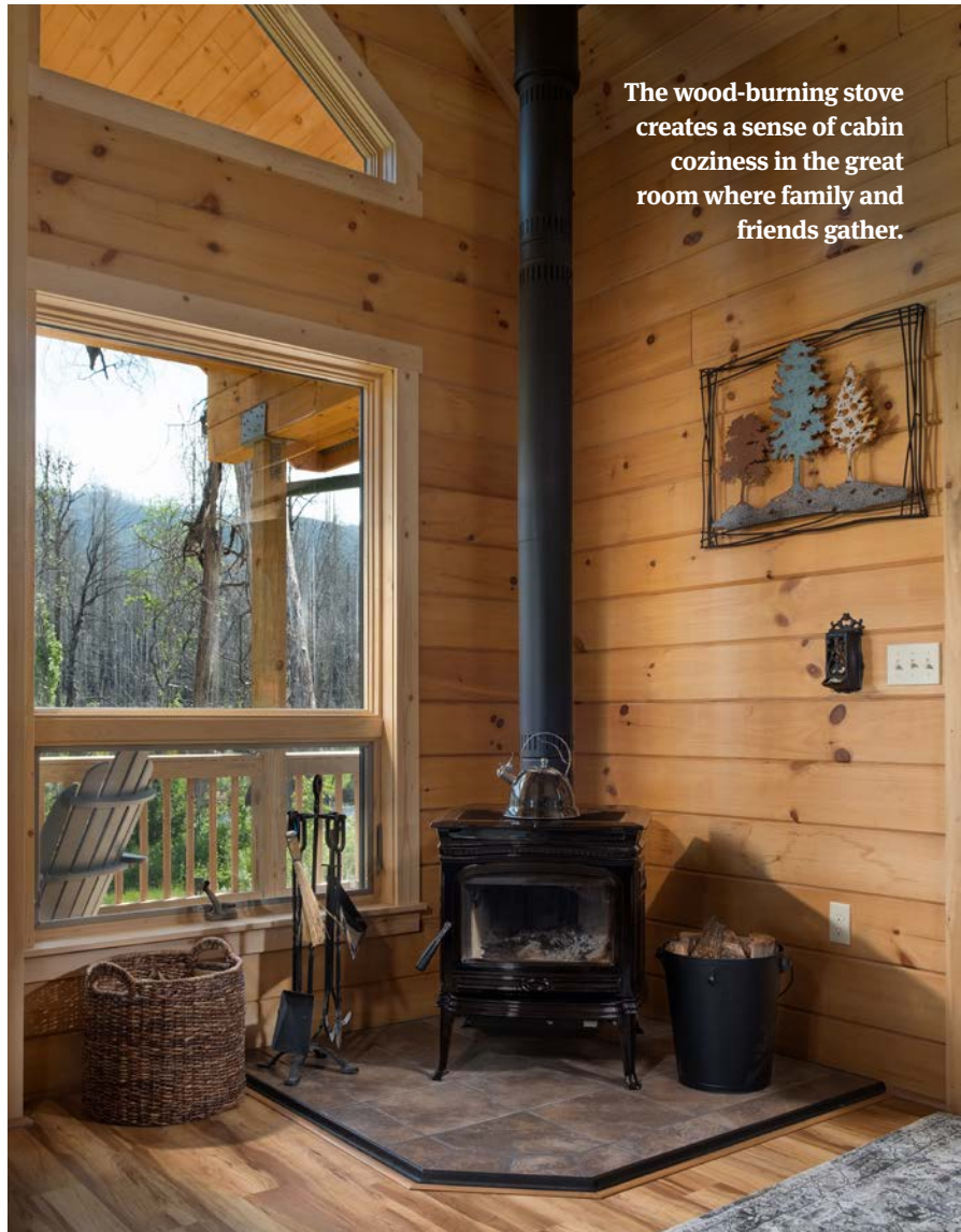
The wood-burning stove creates a sense of cabin coziness in the great room where family and friends gather.

their new, 1,200-square-foot cabin and 400-square-foot outdoor deck. Situated a mere 70 feet from the McKenzie River, the home's design optimizes their enjoyment of the local bounty.