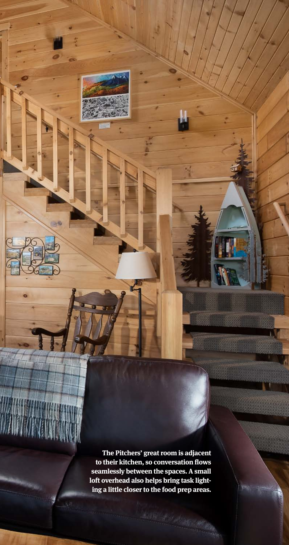
The Pitchers' great room is adjacent to their kitchen, so conversation flows seamlessly between the spaces. A small loft overhead also helps bring task lighting a little closer to the food prep areas.