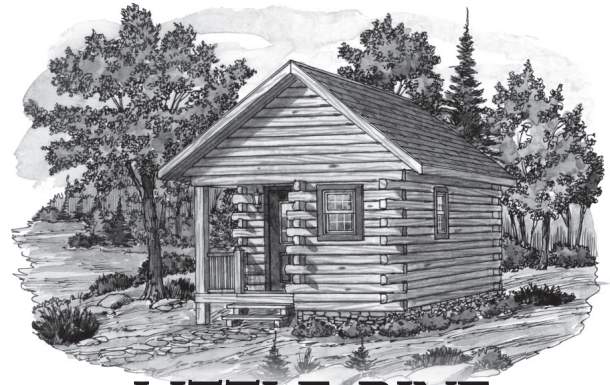
LITTLE PINE 259 sq ft 14' x 21'