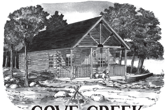
COVE CREEK 569 sq ft 16' x 24'