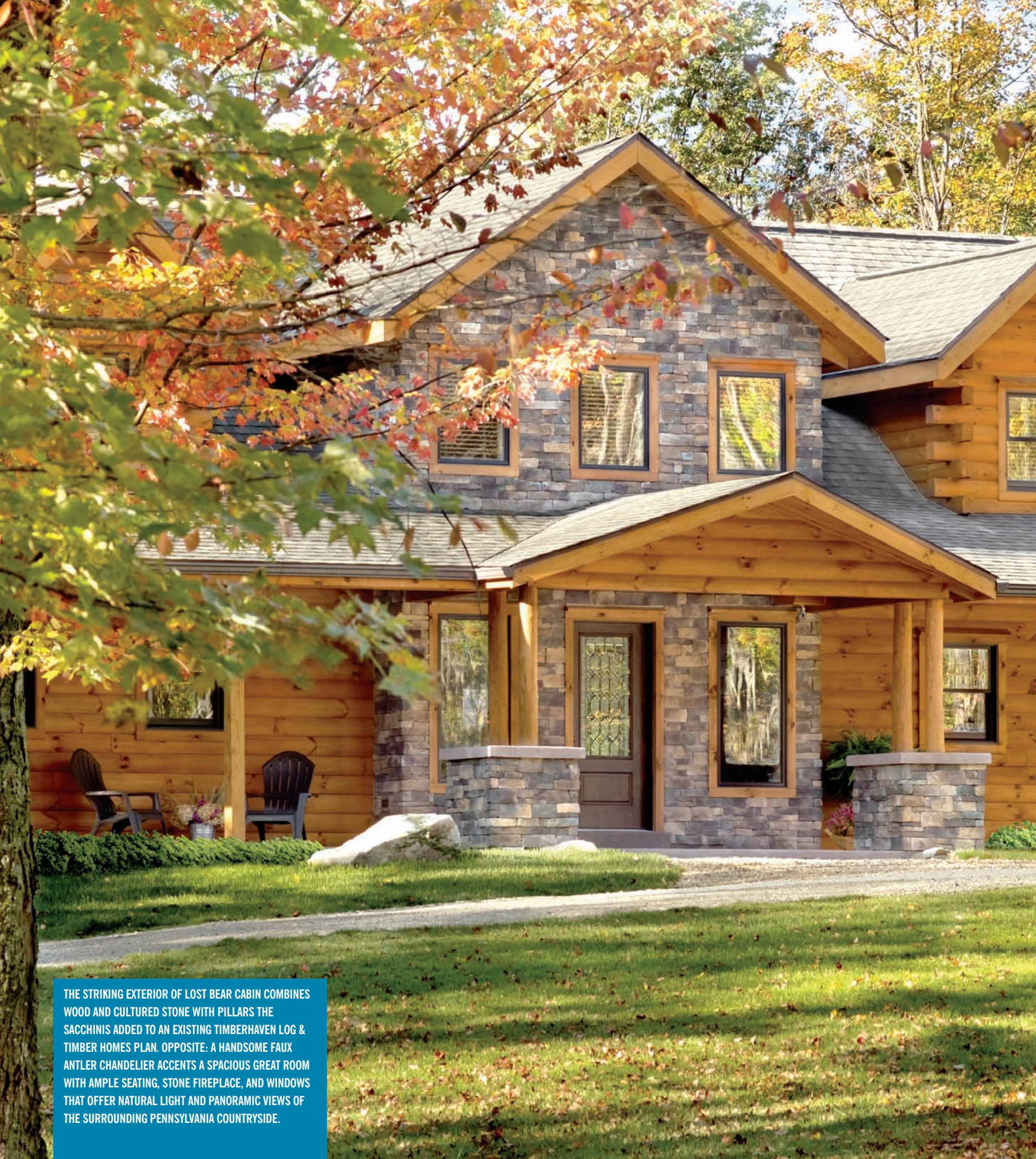
THE STRIKING EXTERIOR OF LOST BEAR CABIN COMBINES WOOD AND CULTURED STONE WITH PILLARS THE SACCHINIS ADDED TO AN EXISTING TIMBERHAVEN LOG & TIMBER HOMES PLAN. OPPOSITE: A HANDSOME FAUX ANTLER CHANDELIER ACCENTS A SPACIOUS GREAT ROOM WITH AMPLE SEATING, STONE FIREPLACE, AND WINDOWS THAT OFFER NATURAL LIGHT AND PANORAMIC VIEWS OF THE SURROUNDING PENNSYLVANIA COUNTRYSIDE.