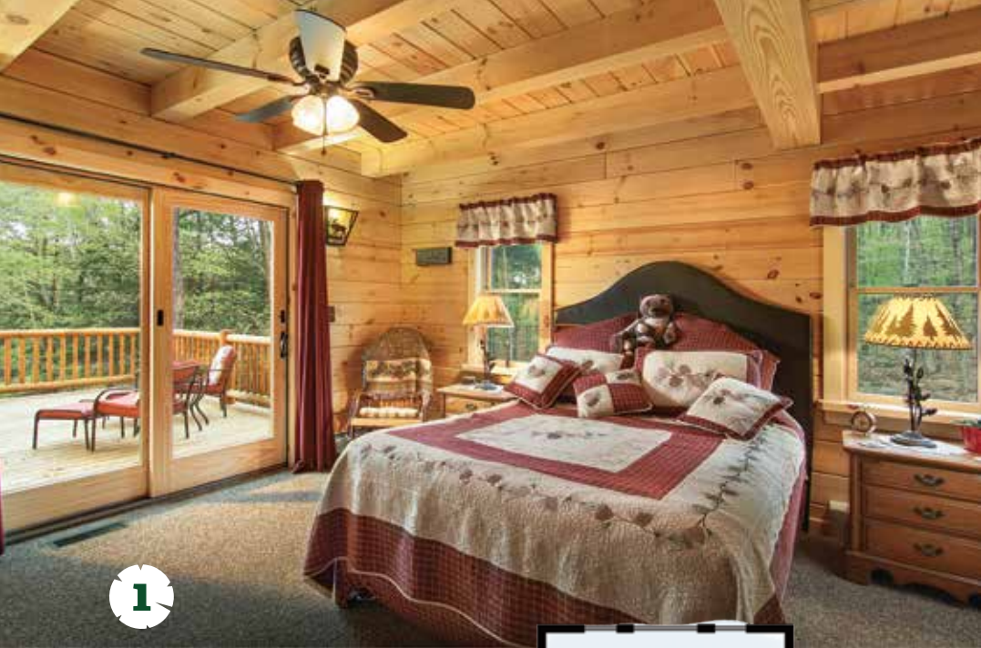
1: Private access to the rear deck gives the simple master suite a sense of luxury.