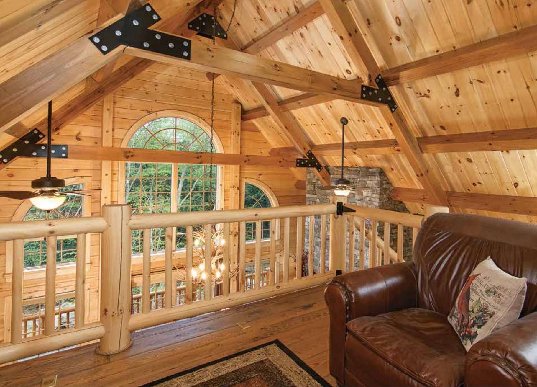
ABOVE: Delivering unbeatable views, the loft is Kim's favorite vantage point. "At night, seeing all of the stars and the moon through the windows is amazing," she says.